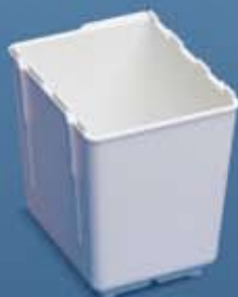
Standard Solution Reservoir, 680 mL—#6147