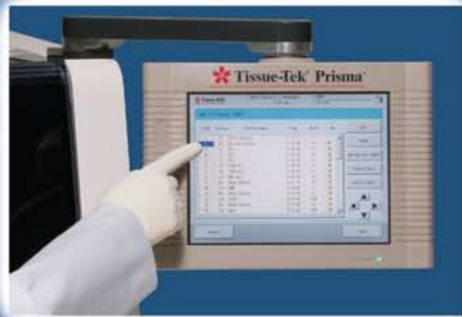
Tissue-Tek® Prisma® software facilitates the instrument's robotic link compatibility with the Tissue-Tek® Glas™ g2.

The Tissue-Tek® Prisma® Automated Slide Stainer and Tissue-Tek® Glas™ g2 Automated Coverslipper system stands apart thanks to its ability to handle two distinctly different duties through one linked system. User-friendly software in each instrument streamlines workflow because operators can fully control system components. Robotics in both platforms offers the latest advances in motion technology, ensuring that slide runs are optimized for high throughput plus a fast, smooth transition from stainer to coverslipper... all without any delay between functions.