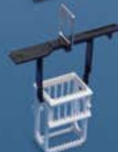
10-slide Basket—#6317 10-slide Basket Adapter—#6138