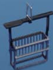
20-slide Basket—#4768 20-slide Basket Adapter—#6136