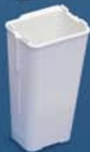
Special Stain Reservoir, 160 mL—#6140