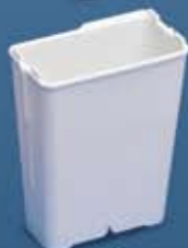
Small Solution Reservoir, 260 mL—#6145