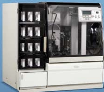
Tissue-Tek® Glas™ g2 Automated Coverslipper—#6500 Tissue-Tek® Glas™ g2 Link System—#6168