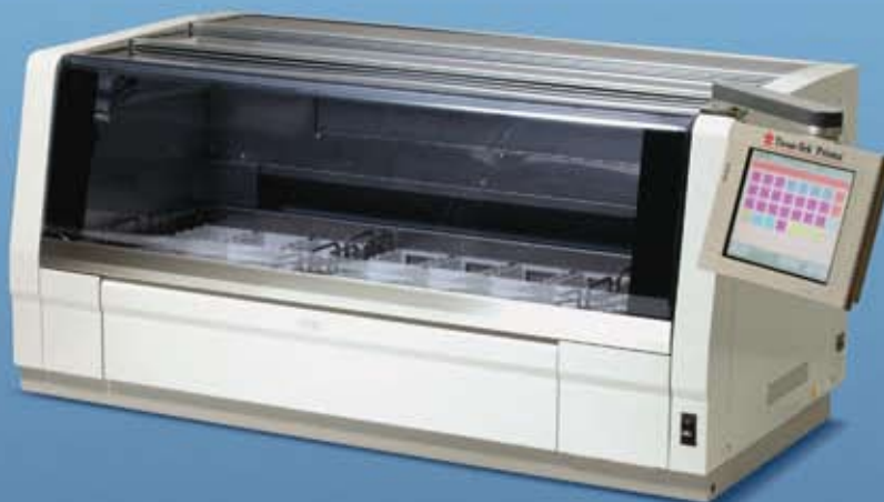
Tissue-Tek® Prisma® Automated Slide Stainer—#6130 Tissue-Tek® Prisma® With Special Stains—#6131