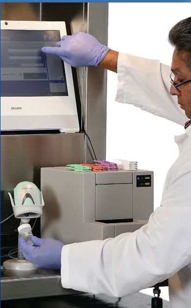
SmartWrite Cassette Printer for low throughput on-demand printing