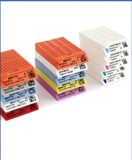
Uni-Cassette® Standard and Biopsy Cassettes for color and black printing