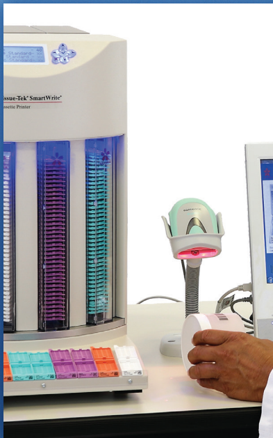
SmartWrite Cassette Printer With AutoLoader