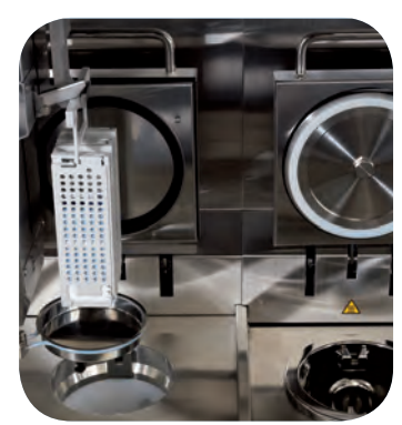
Independent, Multi-Retort Processing