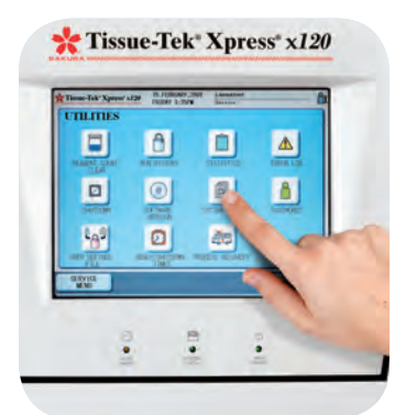
Simple Touch Screen Operation