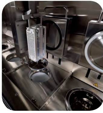
Continuous Loading (up to 40 cassettes)