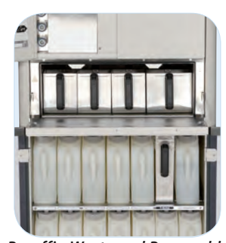
Paraffin Waste and Removable Paraffin Reservoirs