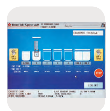
Visually Monitor Processing