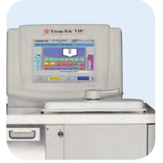
Simple Touch Screen Operation