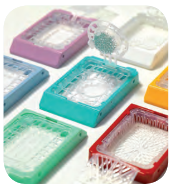
Paraform Sectionable Cassettes