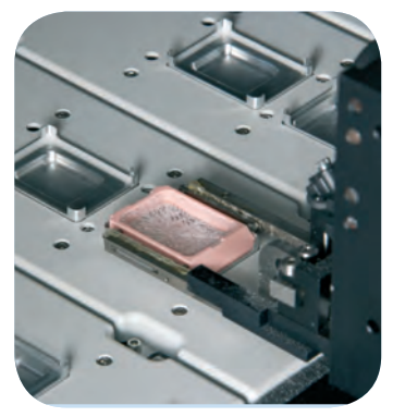
Automated Paraffin Dispensing