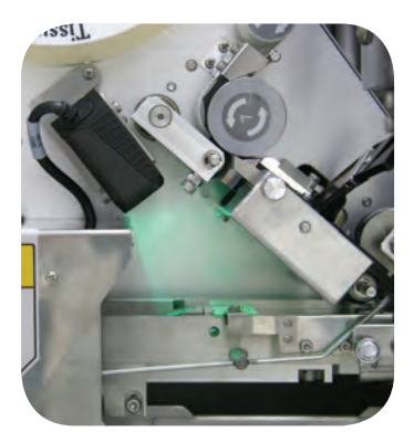
Optional Barcode Reader