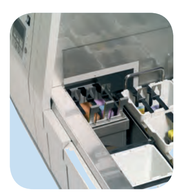
Link to Coverslipper