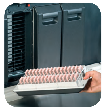
Embedded Blocks in Output Door